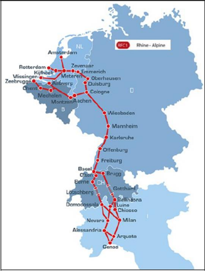
Train path and main corridor nodes